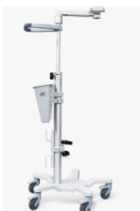
Prevue™ II roll stand