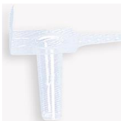
Prevue™ II magnetizer cover