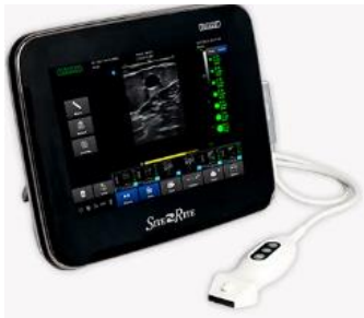
Site-Rite™ Halcyon™ Phased Array Probe (2.5-4.0MHz /30mm)

Visualize the size, depth and location of vessels and surrounding anatomy as part of patient assessment and access.