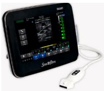
Site-Rite™ Halcyon™ Convex Probe (2.2-5.0MHz /R60mm)

Visualize the size, depth and location of vessels and surrounding anatomy as part of patient assessment and access.