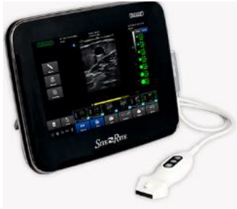
Site-Rite™ Halcyon™ Linear probe with buttons (5-11MHz/30mm)