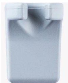
Prevue™ II Probe holder