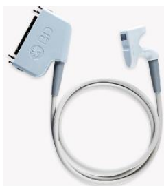
Prevue™ II vascular access probe